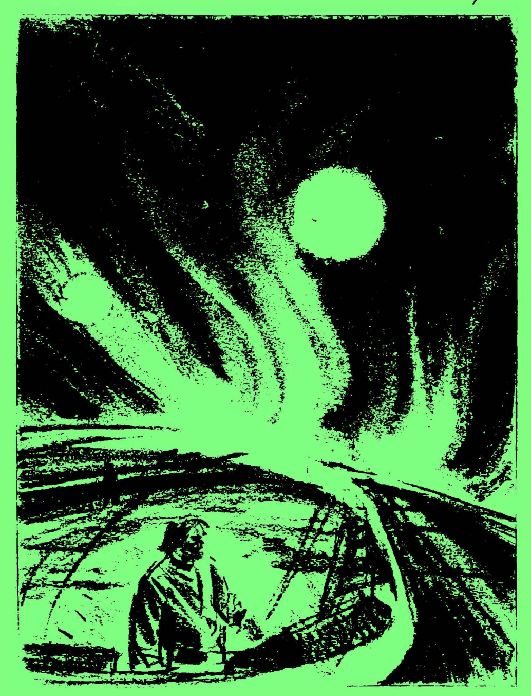
RIVERSIDE QUARTERLY (formerly INSIDE)